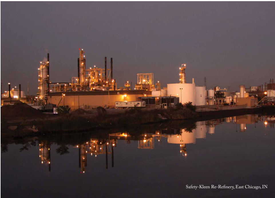
Safety-Kleen Re-Refinery, East Chicago, IN