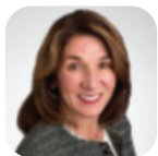
KARYN POLITO Director